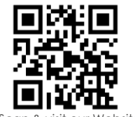
Scan & visit our Website